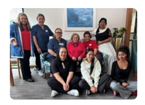
Building relationships based on learning and understanding.

The Te Ao Māori team is also working on a waiata booklet so that residents and staff can share and celebrate Māori music together. The team is also creating a series of karakia, ensuring that meaningful moments can be marked with the appropriate words and traditions.