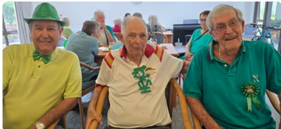
Our apartment residents enjoying St Patricks Day.