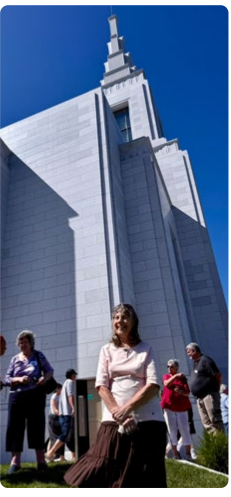
Virtual Village East members enjoyed a number of outings last month including a trip to the Mormon Temple and to see the Warbirds at Ardmore along with the monthly coffee & catch-up.