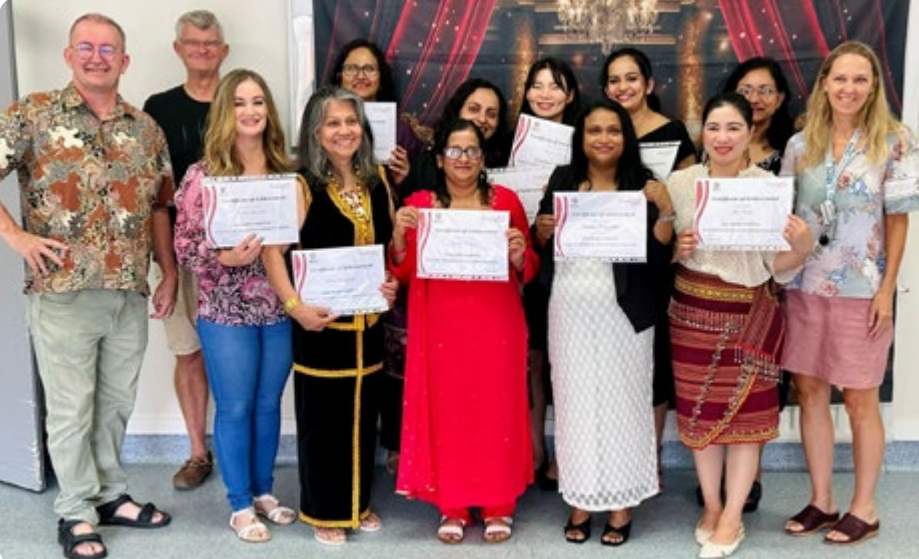
Congratulations to our wonderful graduates!